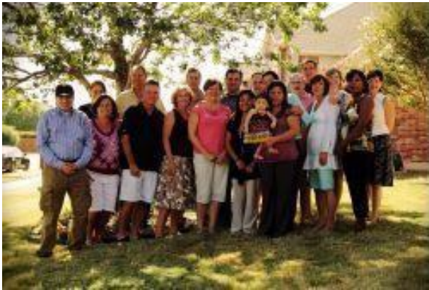
Family Portrait: A graduated Sister in Dallas, TX and her Table.

Each Table is hosted by a congregation (up to three congregations may share a Table). A required team of volunteers (10-12 people help an adult or family and 6-7 help a young adult transitioning out of foster care or a veteran) serve over an 8 – 12 month period. Tables generally meet once a week and often at a lesser intensity as the work progresses. Table members are primarily generalists, work as teams and also provide leadership for important life domains (see Open Table model diagram). A national team of volunteer Open Table Coaches train a volunteer Congregation Coordinator in each faith community to lead the model and launch Tables.