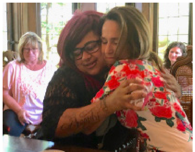
Friend and Table member in Ohio

In many of these important local efforts, significant programmatic progress has been made in the first three outcome areas. As they become adults, transition-age young adults may enter quality transition services which have been provided by non-profits or done in tandem with child welfare or juvenile justice agencies. Ideally, these transition services begin a number of months or even years prior to the transition-age youth becoming adults, avoiding the aging out "cliff" which can await many transition-age young adults.