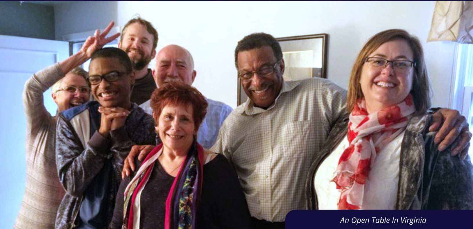
An Open Table In Virginia

OPENTABLE ® RELATIONSHIP TRANSFORMS COMMUNITIES™