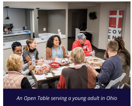
An Open Table serving a young adult in Ohio

Table members come from many different places, including when a business sponsors Tables, from faith communities hosting Tables, and from community organizations or nonprofits. Open Table research on Table outcomes has found that Table membership changes not only the life of the Friend, but of the Table members.