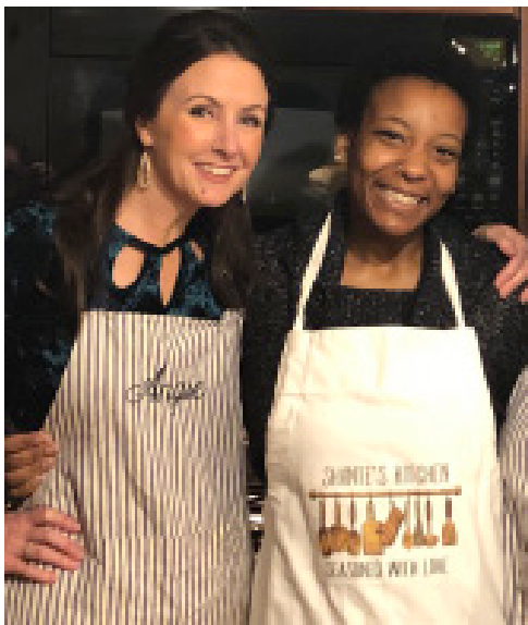
Friend who graduated Open Table 2 years ago and Table member in Virginia

It is important to note that a majority of young adults ages 21-25 have struggles with the goals of continuing education, gaining employment, and learning how to successfully navigate life. Even with a supportive family of origin, most adults can recount their own disasters during these